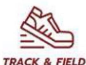
TRACK & FIELD